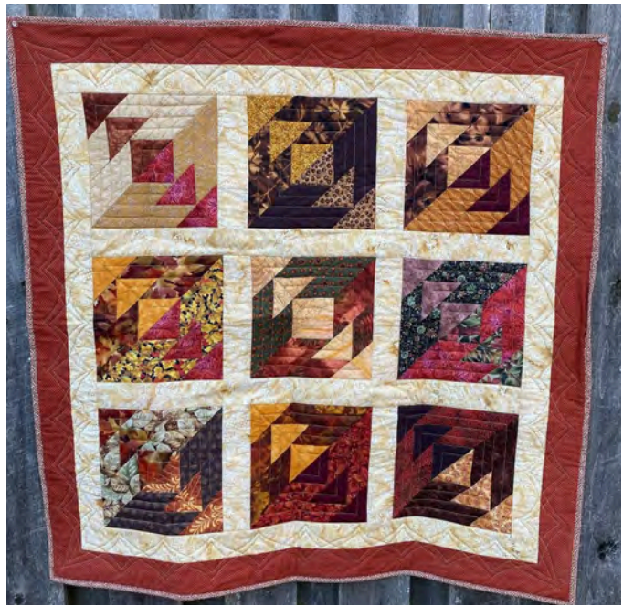
Laura Falk - Christmas tree skirt & very old UFO finally finished!