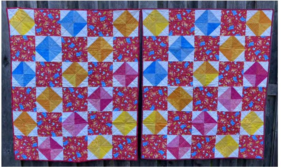
Laura Falk - 3 baby quilts for Operation Shower