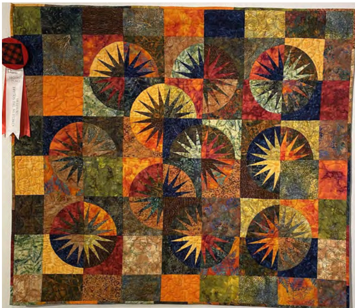
2nd place Wall Quilts - "Desert Sky" Christine Berg