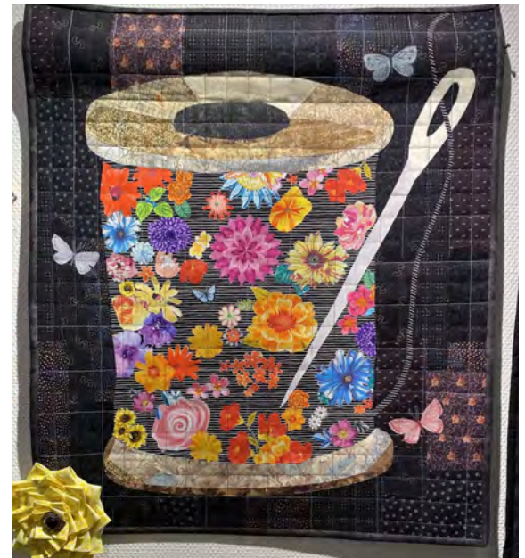
3rd place Small Quilts "Floral Frippery" Laura Falk