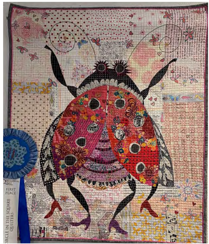
1st place Wall Quilts - "Lady Luck" Naomi Noor