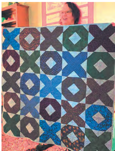
Donna Fox for Operation Shower