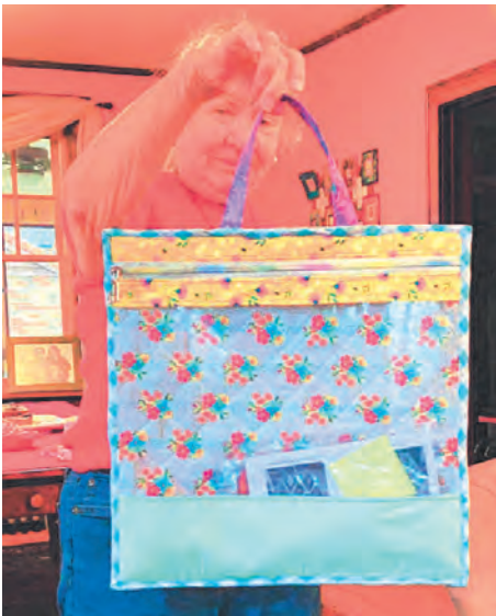
Two projects by Norma Silk