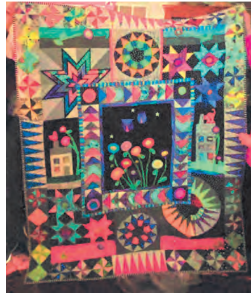
Peggy Harris - Quilted Fox Block of the Month