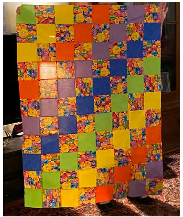
Operation Shower quilts by Donna Fox