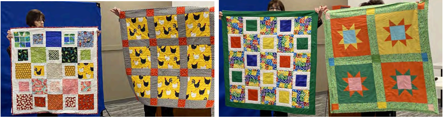
Operation Shower Quilts