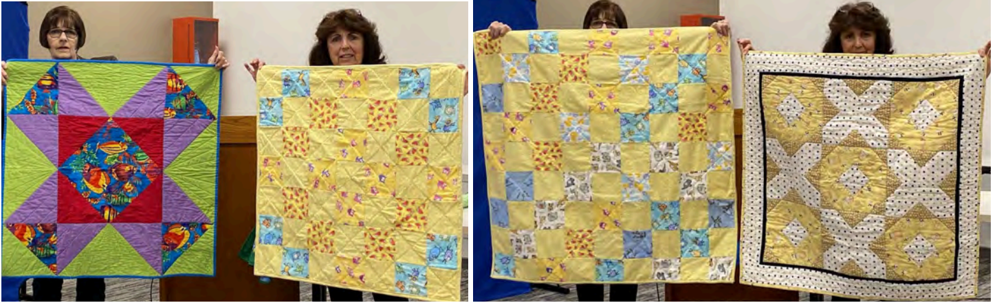
Operation Shower Quilts