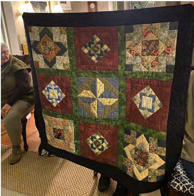
Pat Owoc using leftover blocks from Darlene Schoon