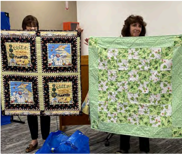
Operation Shower Quilts