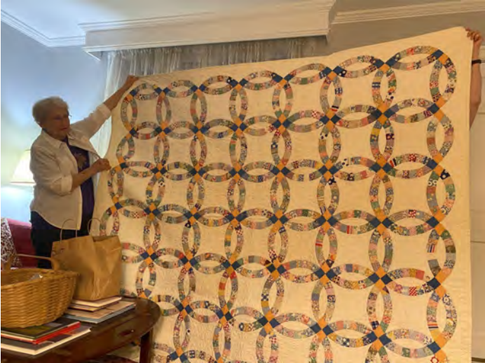
Double Wedding Ring that Pat Owoc finished/rejuvenated