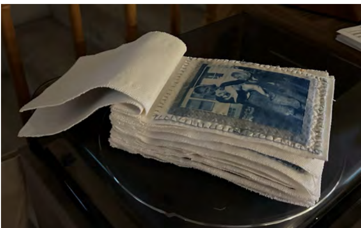
Pat Owoc – A handmade memory book full of family pictures and mementos