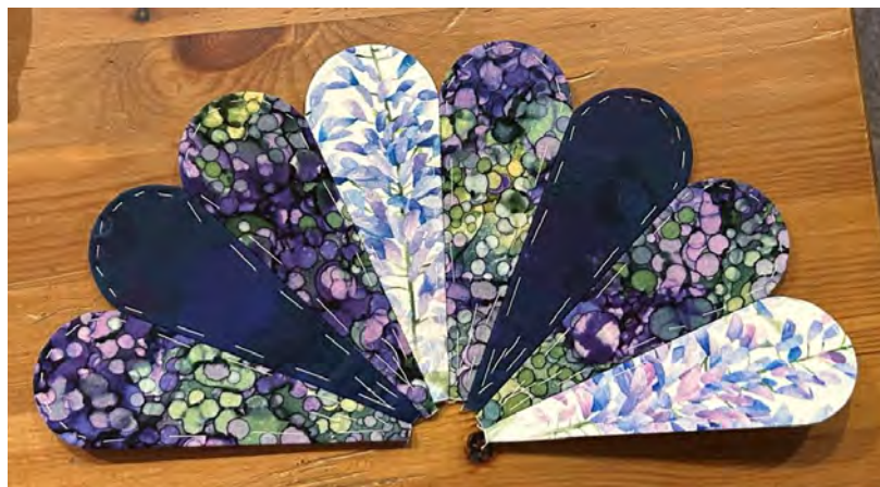
Ruth Hanson's latest paper piecing block - Dresden Plate