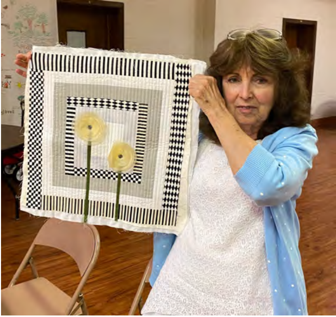
Pillow by Lou Kaufman