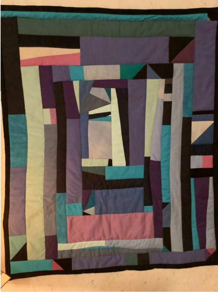
Improv wall hanging by Betsy Sweeney