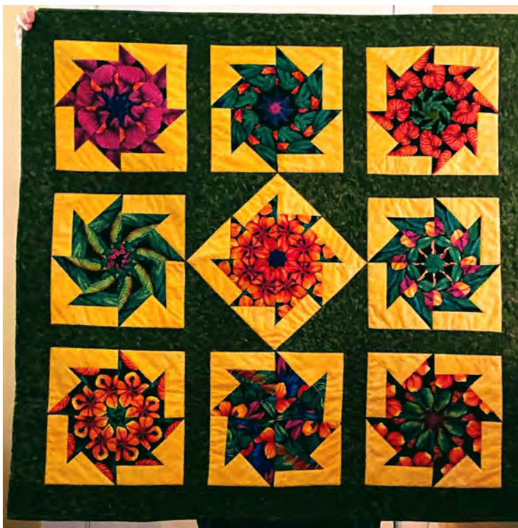
Quilt from Kim's "basement stash" by Pat Owoc