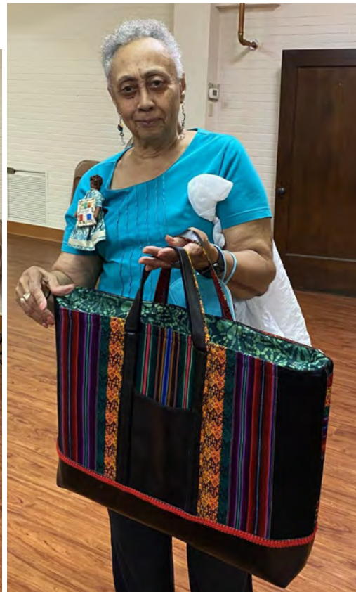
Bag made by Shelbe Bullock