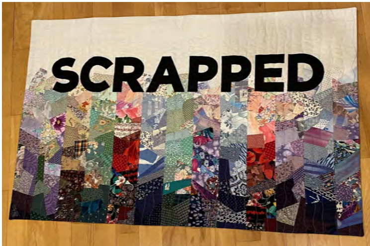
"Scrapped" by Pat Owoc