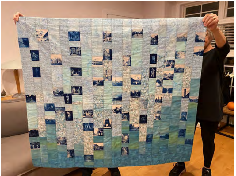
"Grand Tour: Places I Should Have Seen" by Pat Owoc