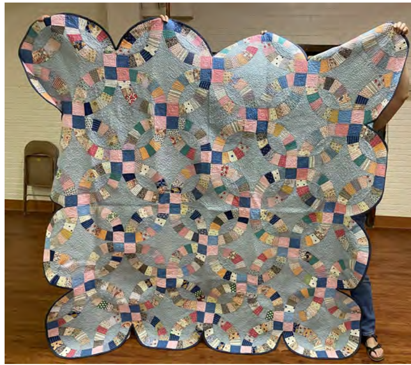
Quilted and bound by Gwen Clopton