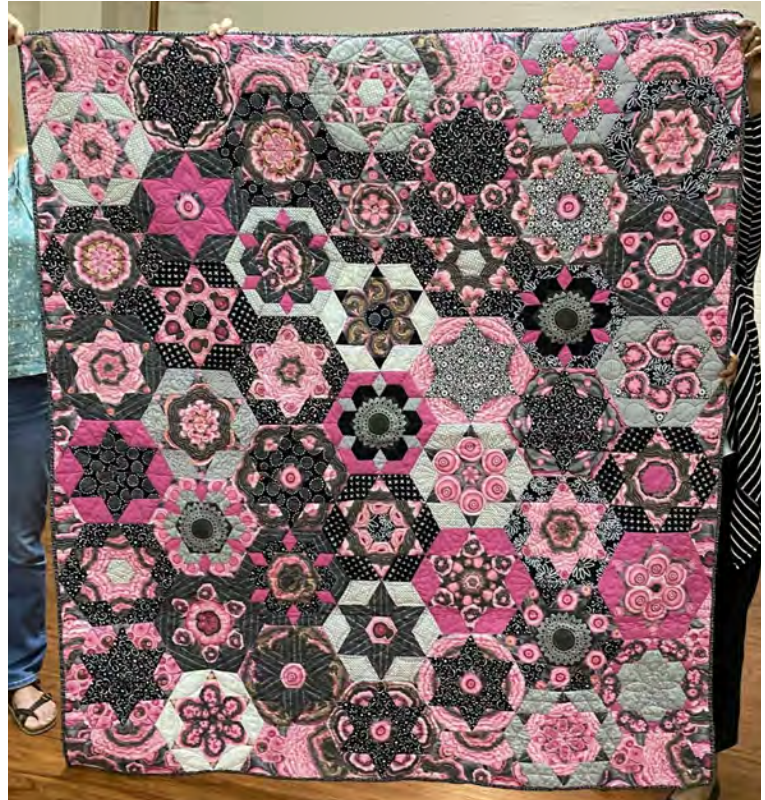
"No Apologies" by Joyce Johnson