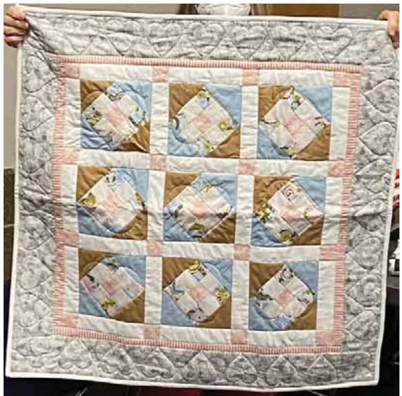
This one's a mystery - I missed the name! Sorry! Please claim it!