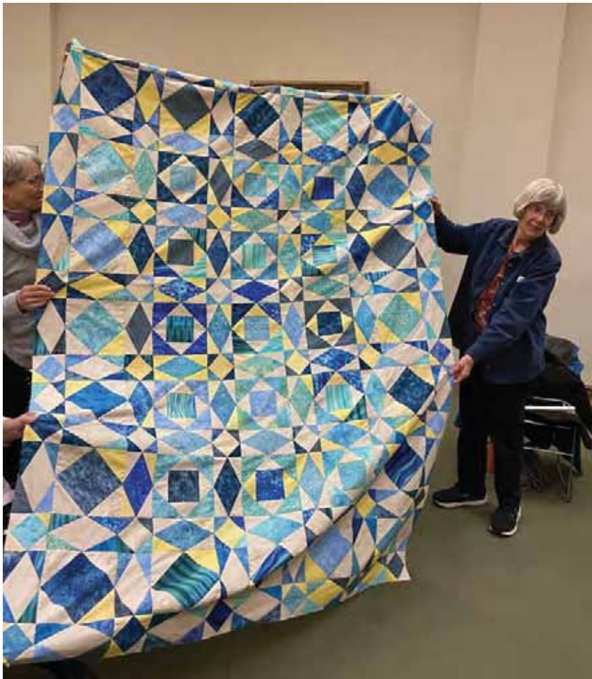
Carol Peck's Storm at Sea