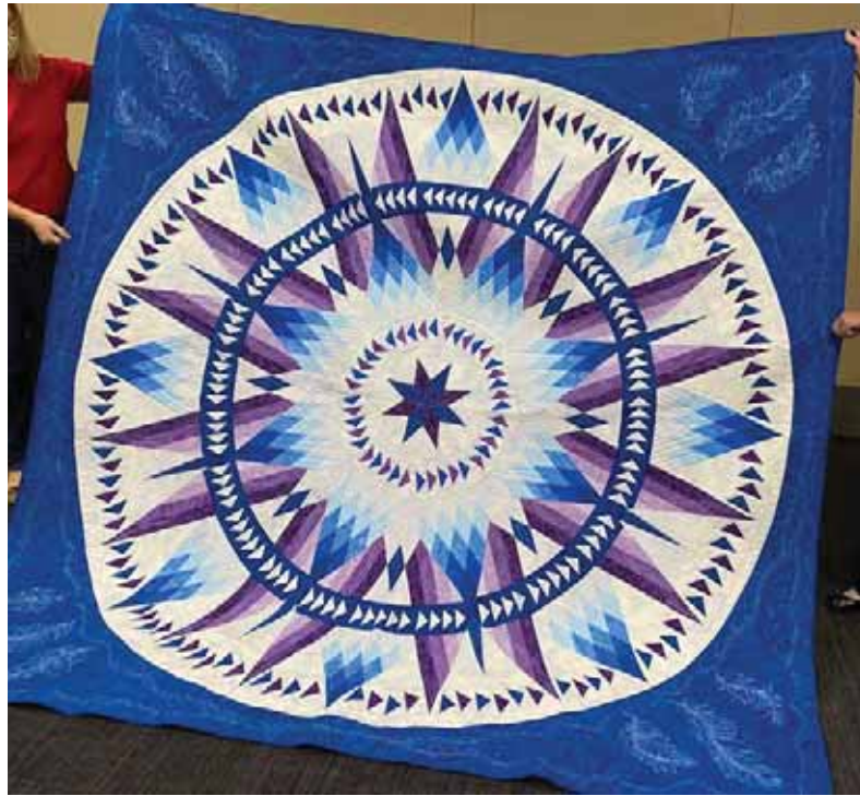
Dolores Keaton: Close-up of quilting and front of star quilt