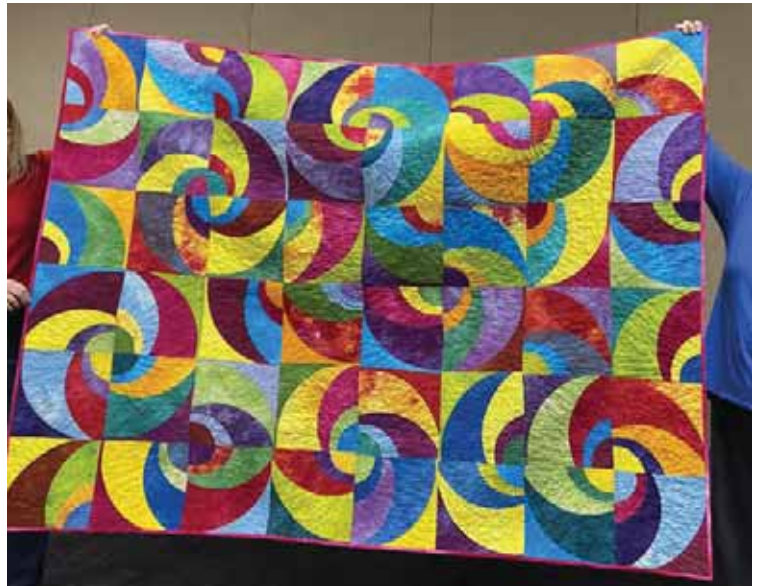
Gwen Clopton: Postcards from Sweden quilt & swirl quilt