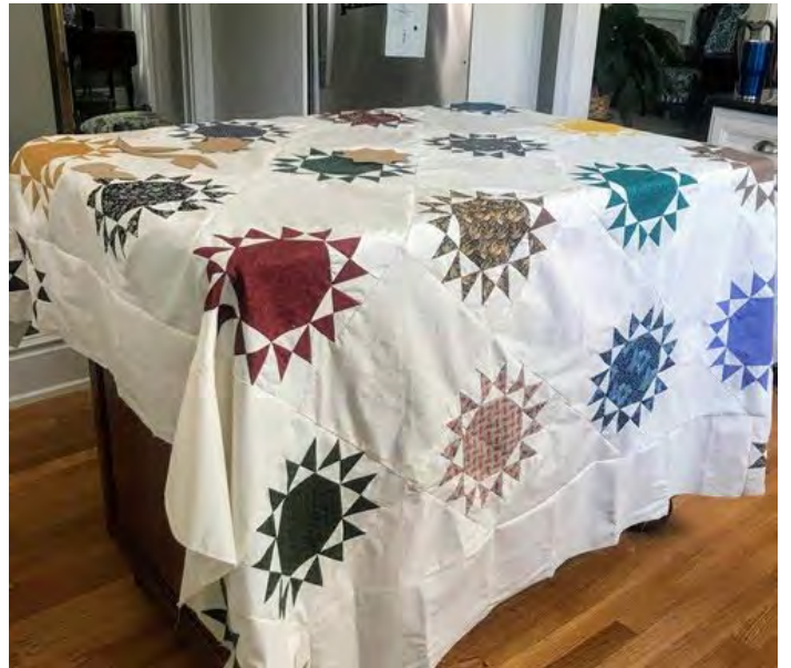
Quilt top by Betsy Sweeney being marked for