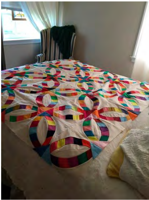
Betsy Sweeney Quarantine Project #1