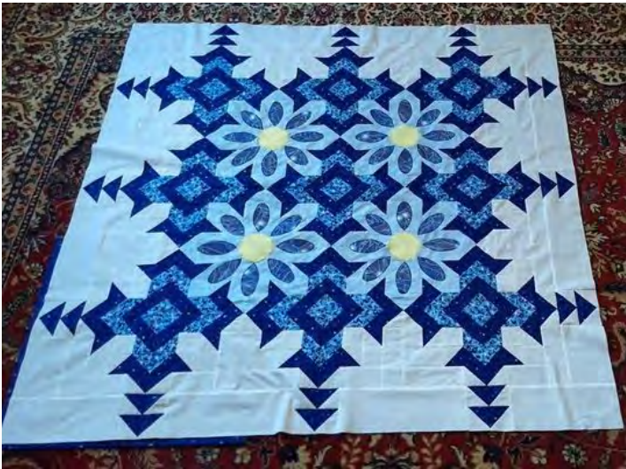
Laura Falk - finally finished piecing this top from a kit called "Moonlight Garden"