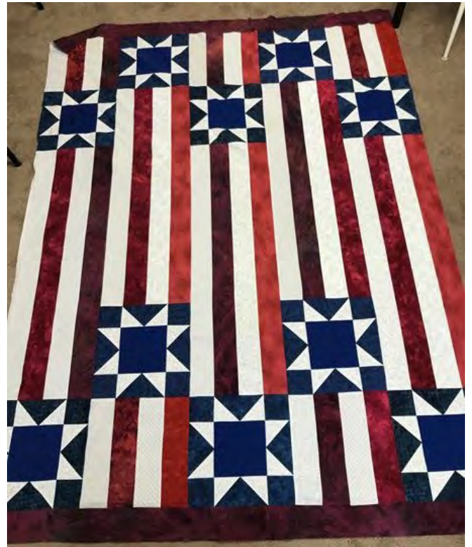
Dolores Keaton - Quit of Valor