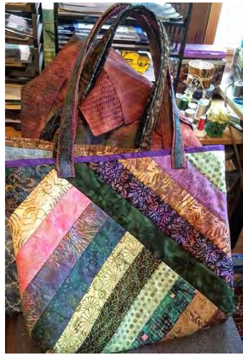
Laura Falk - quilted tote bag