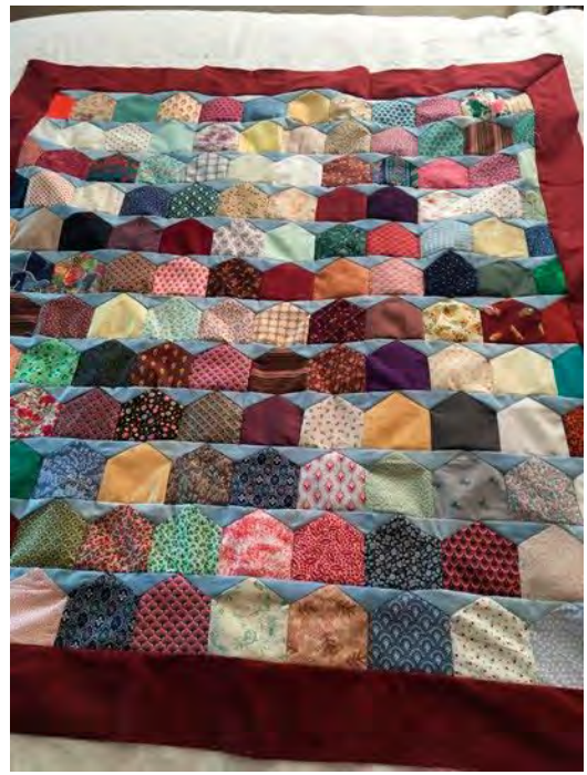
Betsy Sweeney Quarantine Project #2