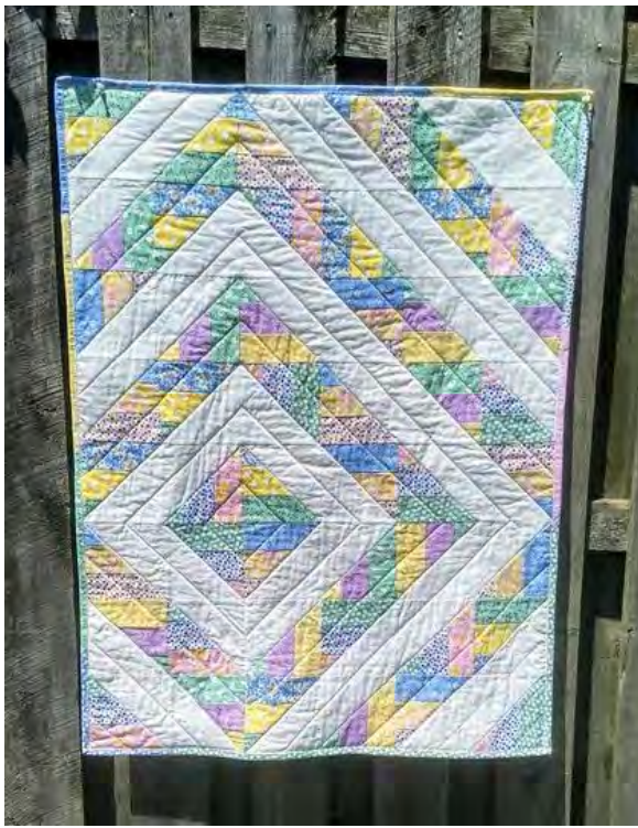
Laura Falk - baby quilt top for Operation Shower