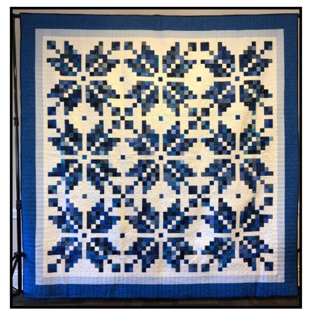
Raffle Quilt: Norwegian Snowflakes

10403 Clayton Road St. Louis, MO 63131 Phone: 314-993-1181