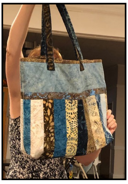
Laura Falk's quilted bag