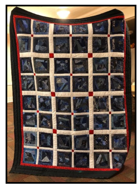
Suzanne's blue scrap quilt