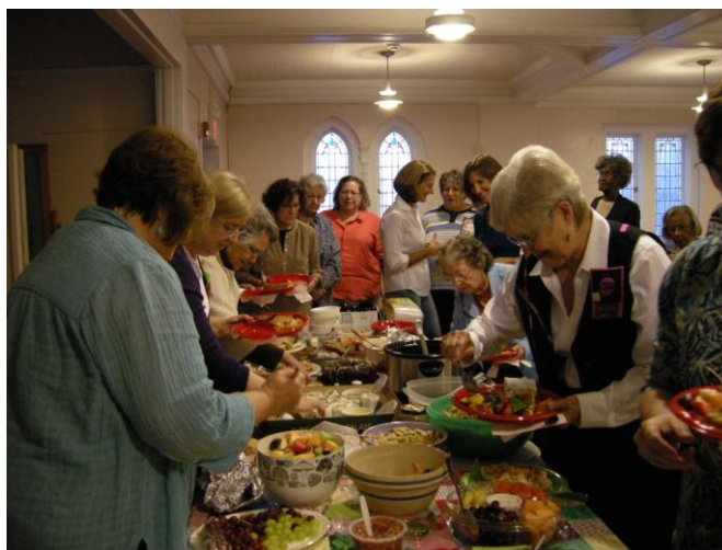
Wonderful food and a great attendance!