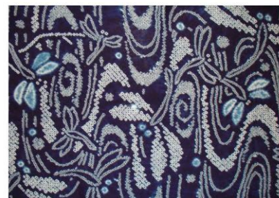
Hand tied and dyed Shibori fabric

Remember to bring canned food for the food pantry at the church. Membership Rosters will be distributed and kits at the March meeting. Kits for